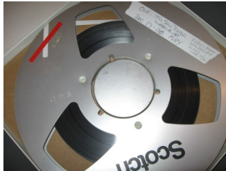
One of 100 OISD audiotape reels

The Out in San Diego collection contains 100 reel-to-reel audiotapes of the mid-80s radio show run by Jeri Dilno and Rick Moore. Topics included local culture, national news, the AIDS crisis, and other LGBT issues.