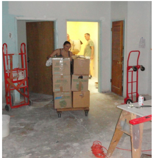
Thank goodness for Girrrl Power!