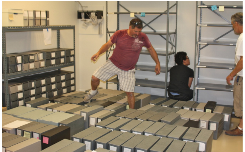
Moving collections into a new space; a space with room to breathe ... and play!