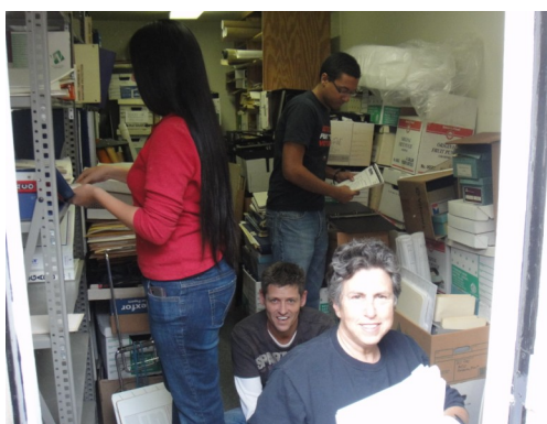
Pride volunteers join Lambda Archives in preparing for move.