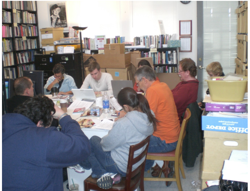
Meeting was possible in the old space — a little crowded, but possible.