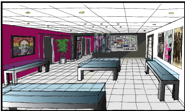
LAMBDA ARCHIVES EXHIBIT ROOM

With Your Help, We Can Make This Vision Happen.