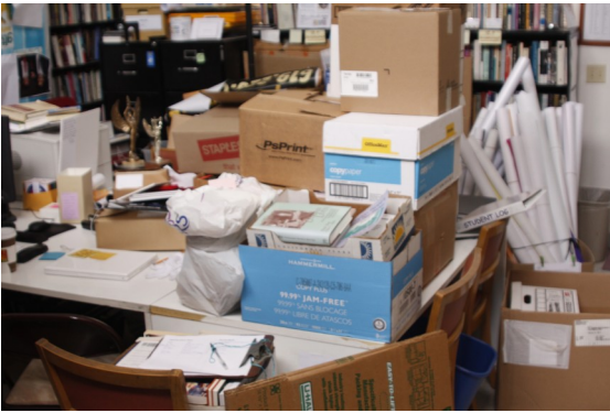
It all fits; just don't breathe too hard!